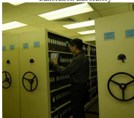
產品標準圖書館 Product Standards Library